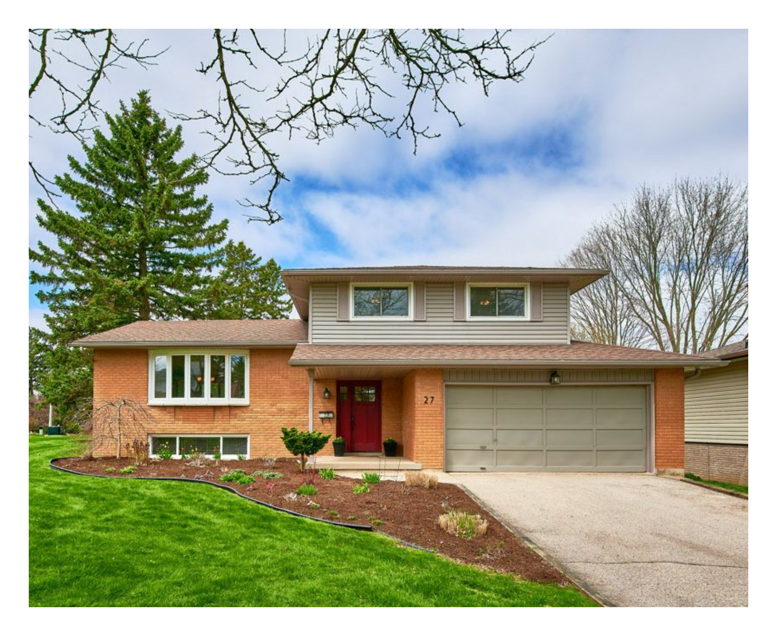
27 Karen Ave., Guelph ON